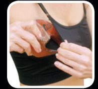
Easy GEL-O's Insertion For Hands-Free Cold Therapy.